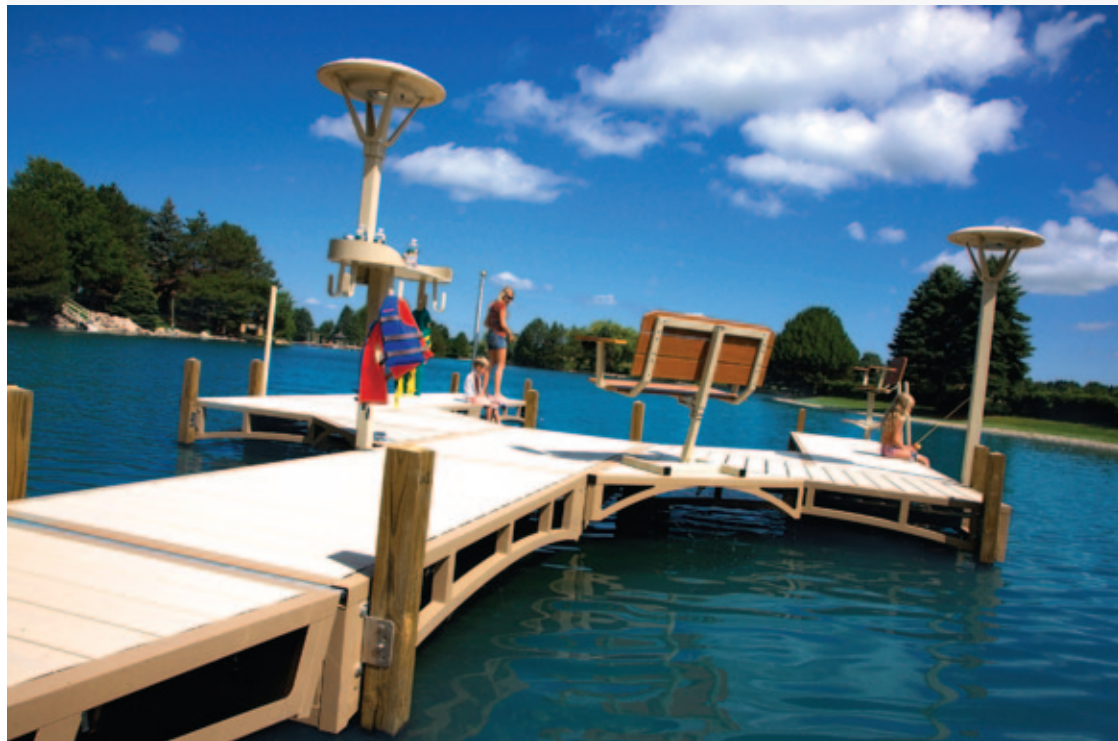
ShoreStation's Gear Tower has six storage hooks under the large table top surface. An optional light attachment not only helps illuminate the items on the table top, but provides additional lighting over a portion of your dock's surface.