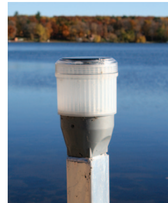
Porta-Dock's Solar Dock Lighting provides over 18 hours on a full charge and mounts to any Porta-Dock with the included bracket.

Most dock accessories can be placed anywhere along a dock's surface, allowing you to customize according to your dock's layout.