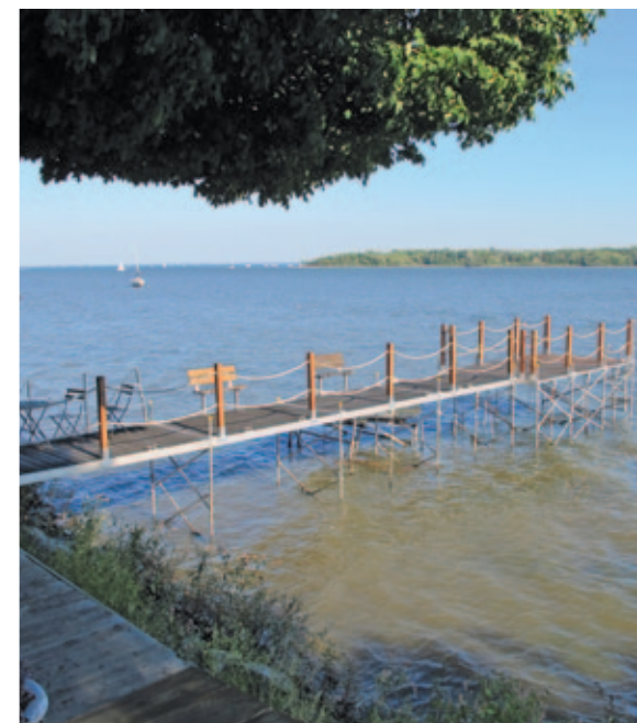
LEFT: Rope railings, like these from Eastern Township Docks, keep you safe while giving your dock a more natural look.