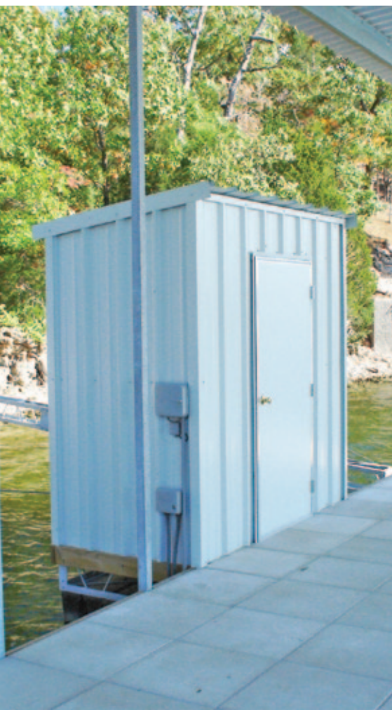
ShoreMaster's Storage Shed provides you with enough space to tuck away all of your favorite on-the-water toys.

as a bench comes with options. Do you want cupholders? How about something ergonomically designed to make it easy on your back? Or maybe you'd like a full 360-degree pivot to take advantage of all that your view has to offer? Whatever your choice, there's a bench out there for you. And some even mount out and over the water, saving valuable deck space.