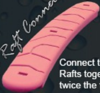
Rip Raft Connector

Connect two Rip Rafts together for twice the fun!