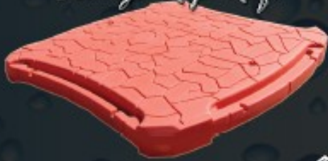
Orange Rip Raft